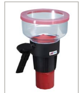
Solo 332 Aerosol Dispenser for larger diameter detectors.