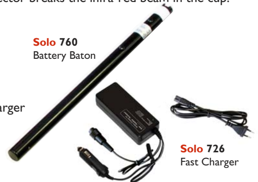
Solo 726 Fast Charger