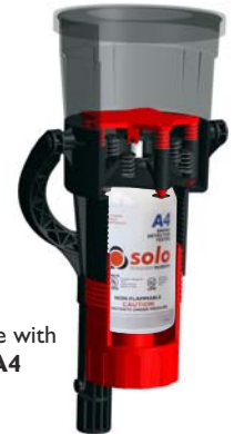
For use with Solo A4

The Solo 332 is available for detectors with larger bases.